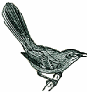
The mockingbird is the state bird of Tennessee. Cordell Hull represented a district of Tennessee in the Congress of the United States, and was elected a senator from there, before becoming U.S. Secretary of State (1933-44).

As rural America enters the era of the entrepreneurial economy, its sparse network of equity funds becomes a bigger problem. There are many potential responses. Philanthropies are playing an important role. The Nebraska Community Foundation, for instance, is mounting a new campaign to put charitable donations into equity funds that can fuel new businesses in greater